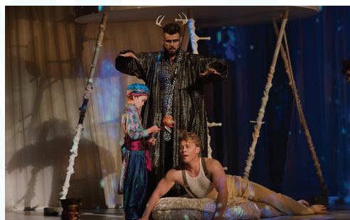
as Lysander in Midsummer Night's Dream with Pacific Opera Victoria

Serenade for Tenor, Horn and Strings Britten | Thirteen Strings, Ottawa Elijah Mendelssohn | Vancouver Bach Choir Messiah Handel | National Arts Centre Orchestra, Ottawa Viennese New Year Victoria Symphony Orchestra