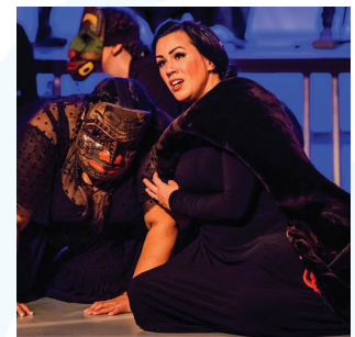
as Native Girl in Missing with City Opera Vancouver (left), and as Aile in Gállábártnit (right)