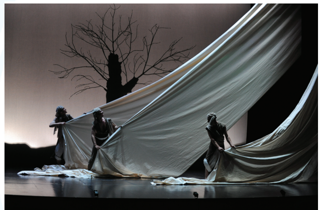
Dido and Aeneas with Theatre Bleue, Switzerland